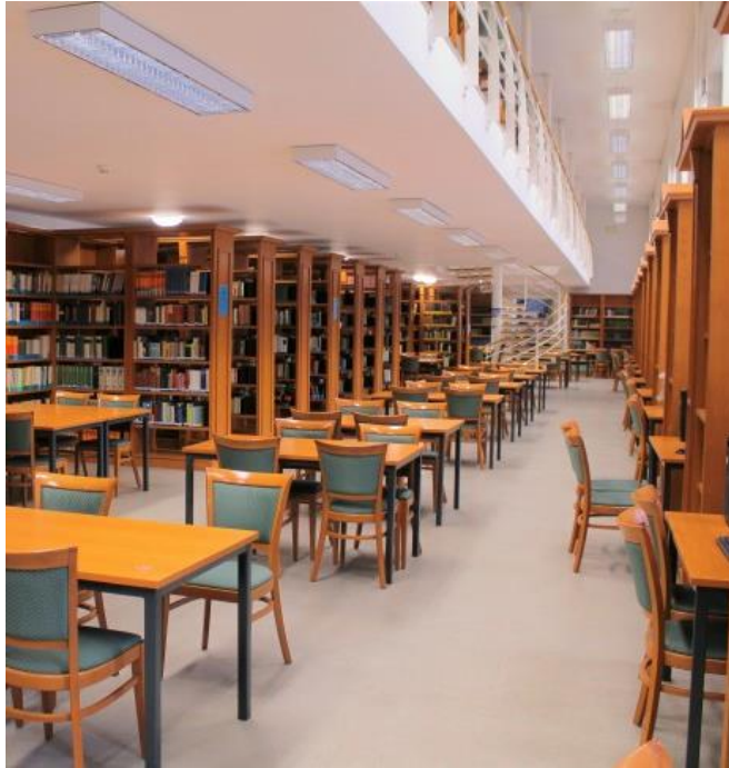
Central Reading Hall