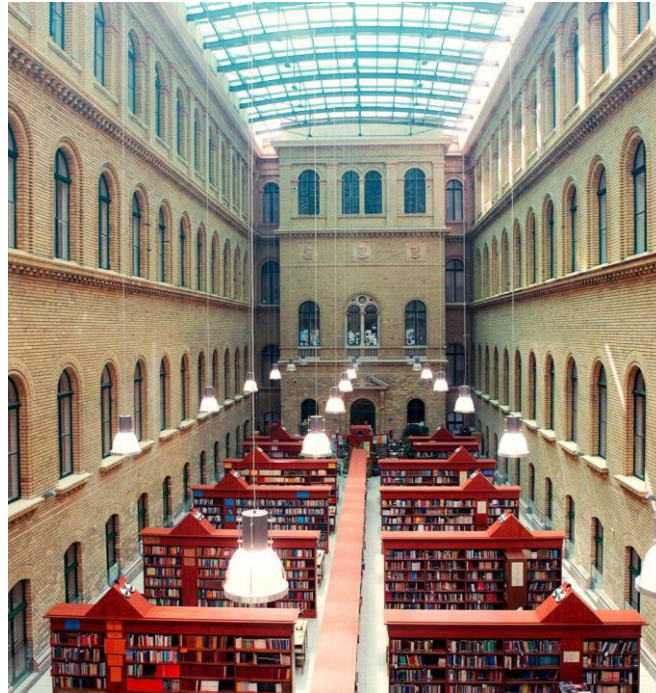
Library of English-American and Germanic Studies